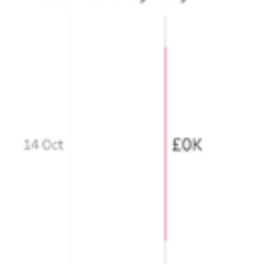
Investment by day