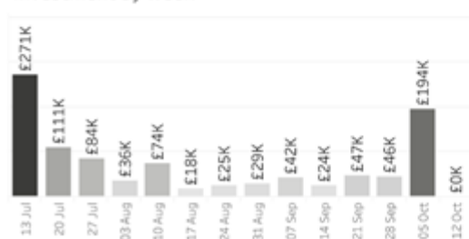
Investment by week